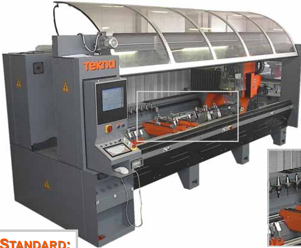
Rotating and standard clamps

AXIS SPEEDS (INCHES PER MINUTE): X—3,150 | Y—1,181 | Z—1,181