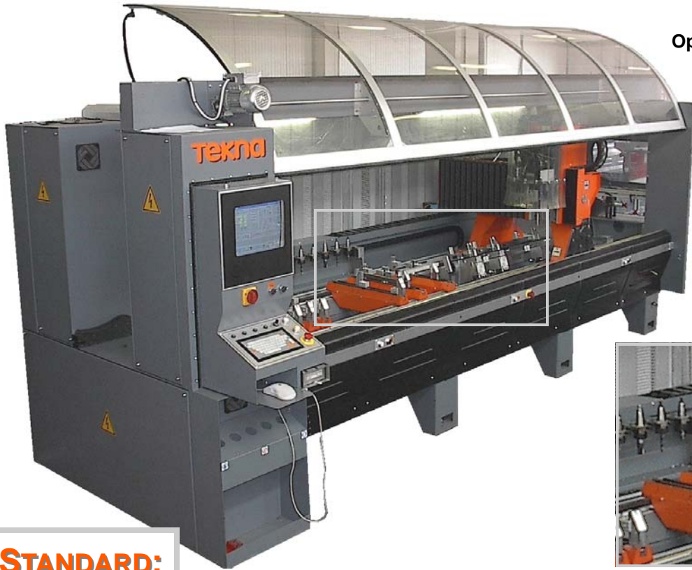
Optional sound deadening enclosure

AXIS SPEEDS (INCHES PER MINUTE): X—3,150 | Y—1,181 | Z—1,181